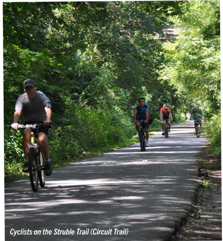
Cyclists on the Struble Trail (Circuit Trail)